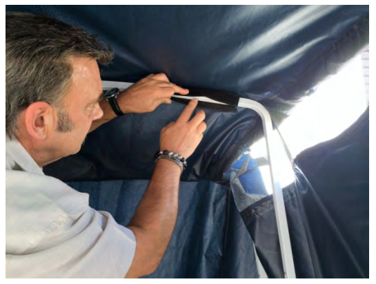
12. Attach all the bottom velcro straps to the base poles of the shelter.