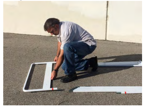
4. Connect the right side poles.

2. Lay down the anchor plate cross bar on a flat (level) open surface. The two black protective feet should be facing downward.